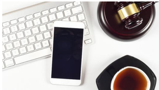
Figure 1 The concept of electronic evidence

Electronic evidence is litigation evidence stored in magnetic media in the form of electronic data. The new Code of Criminal Procedure has included "electronic data" as one of the types of evidence.